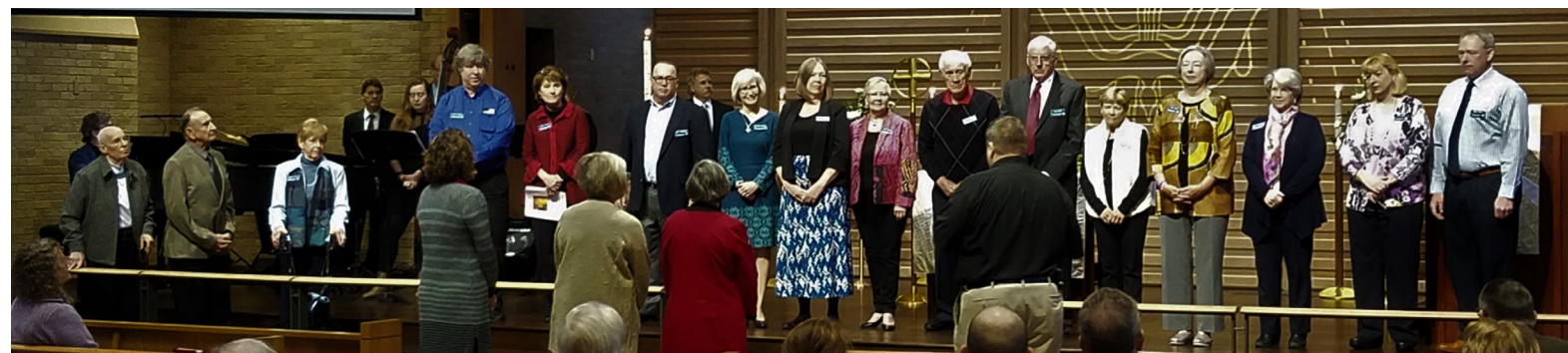
Class of 2018 Stephen Ministers